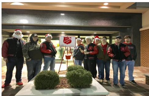
Members of the Sr. High Football team served as Salvation Army bell ringers at the Mall at Turtle Creek