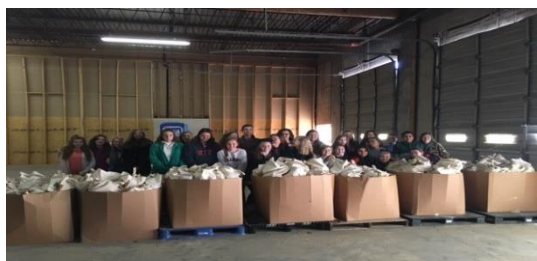
The Junior High Student Council went to the Salvation Army in early December to assist in preparing gift bags for Northeast Arkansas struggling families with young children.

The 4th annual FFA Dinner and Auction will be held January 28th at 6 pm at the Brookland Baptist Church. Dinner will be BBQ sandwiches and Smoked Chicken Dinner Plates are $10. There will be numerous items available for bid in our live auction.