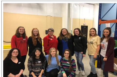
Members of the Spanish Honor Society volunteered at the Food Bank of Northeast Arkansas